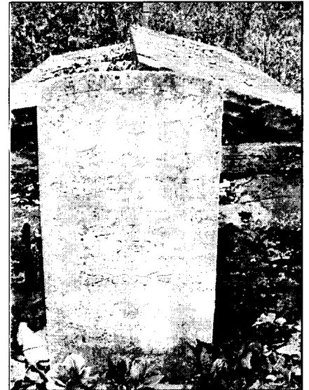
Belle Starr's grave was hard to find, but worth the effort.

The tombstone is a replica of the original stone placed by Belle's daughter Pearl.