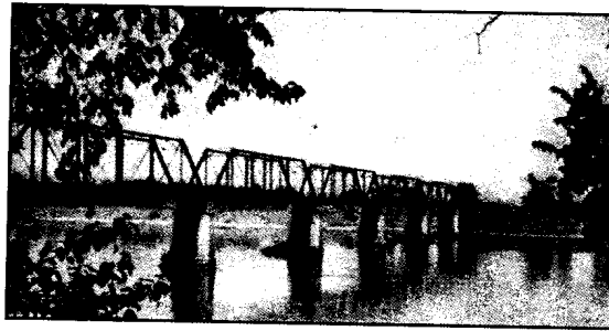
Railroads built the first bridges over the Arkansas River at Three Forks.

One branch came from Baxter Springs, Kansas, and followed the Verdigris and Grand rivers to Fort Gibson. The other